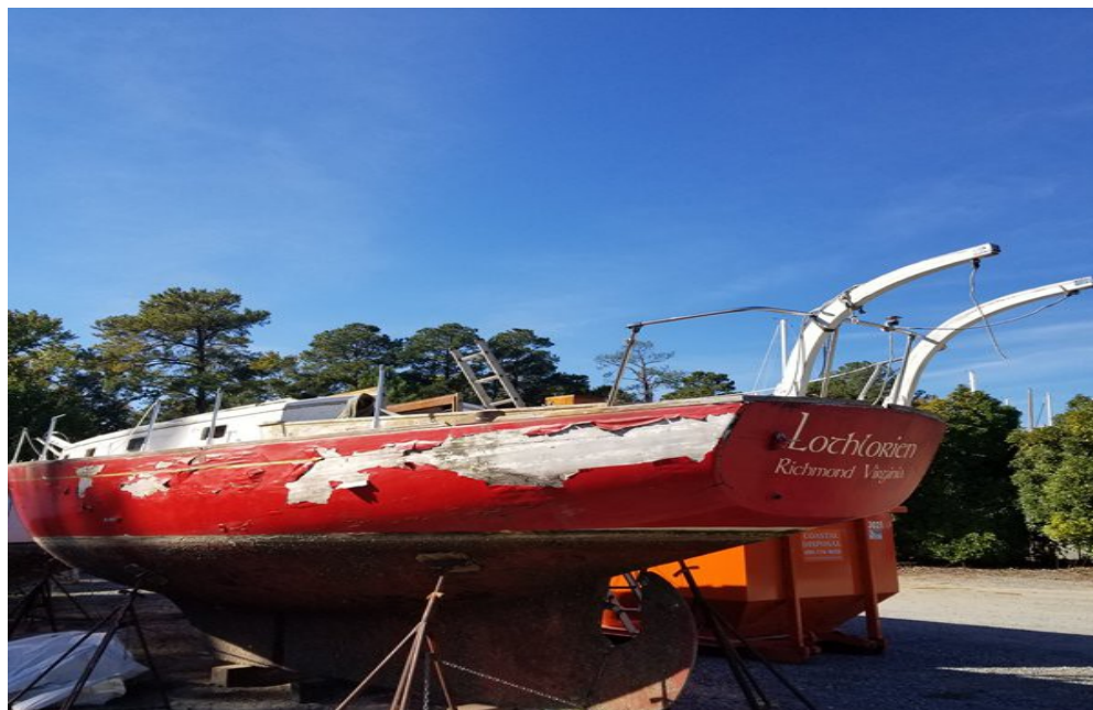
Illustration 3: LOTHLORIEN ready for the dumpster in 2021