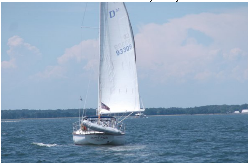
Illustration 5: STARRY NIGHT under sail!

Remember, our 2022 Rendezvous is less that 213 days away!