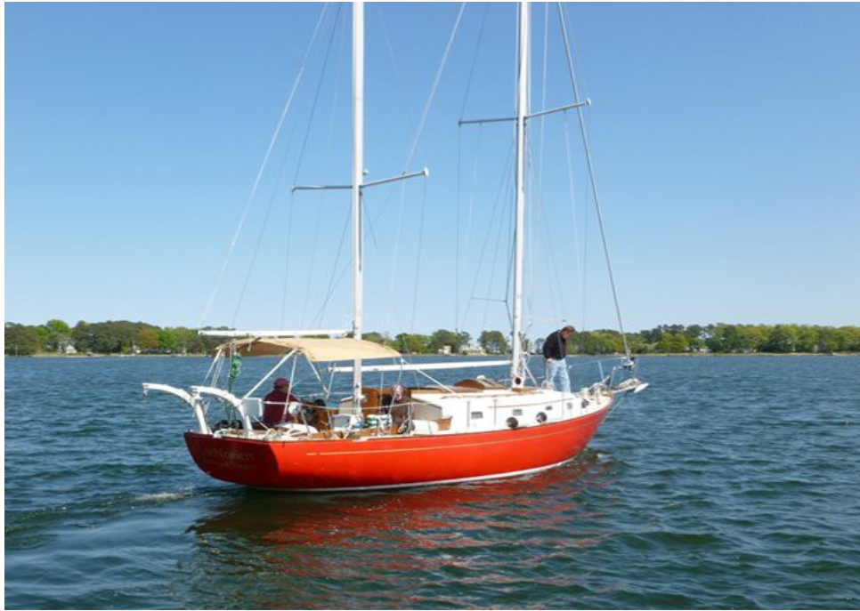
Illustration 2: LOTHLORIEN in better times in 2011