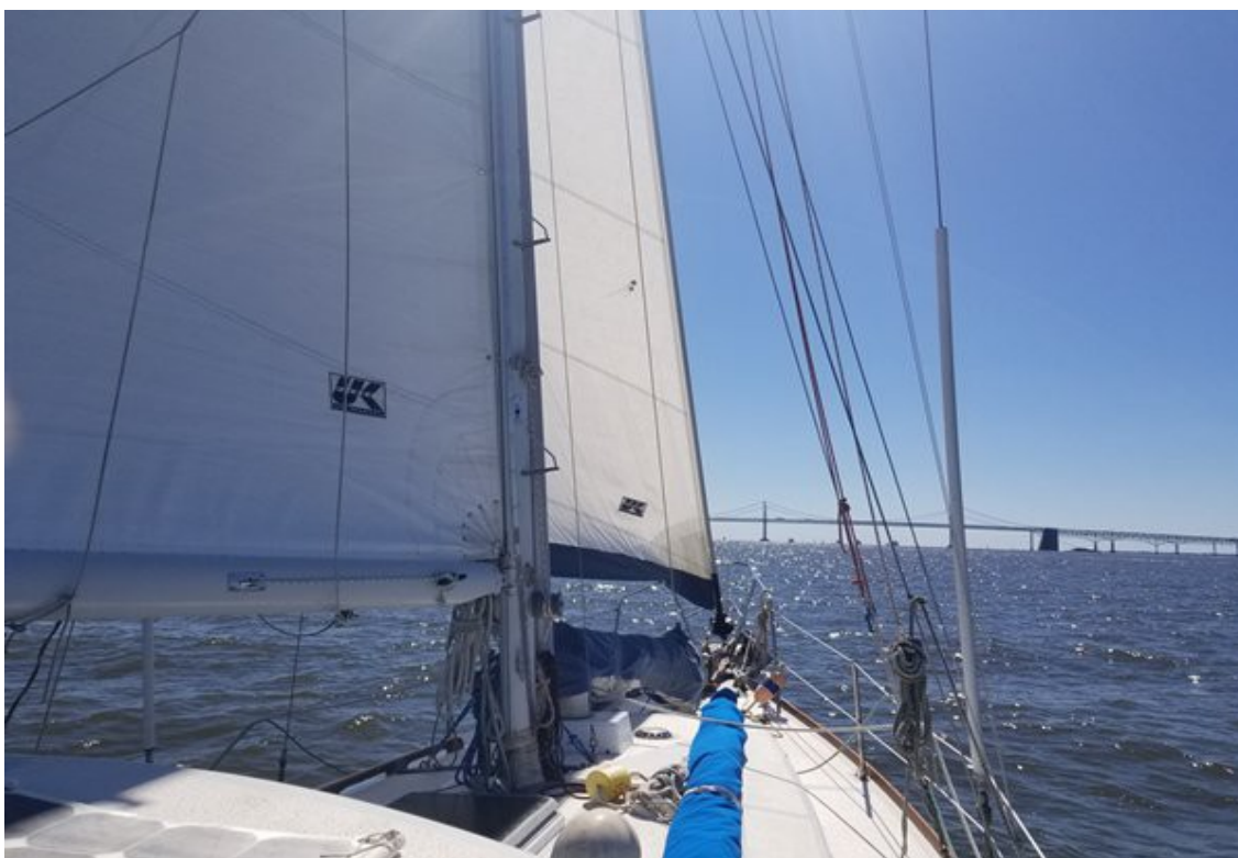
Illustration 1: PLOVER under sail down the Chesapeake Bay