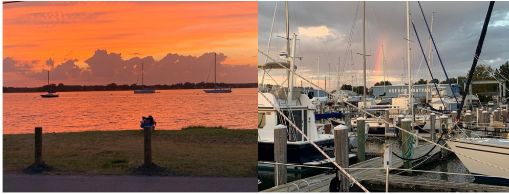
Red Sky by Night