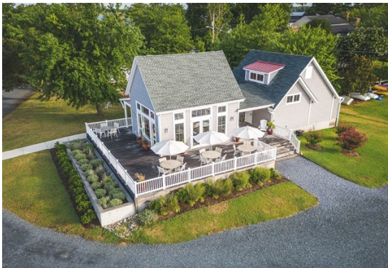
“Best on the Bay” facilities

Safe Harbor, Oxford is hosting two events per month, so visit regularly for fun in the sun on the water.