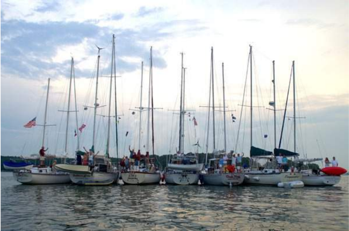
Illustration 1: Seven Dickersons raft up after 50th Anniversary!

On Monday 15 June, a smaller group of three 41's, PLOVER, SOUTHERN CROSS & TOOGOODOO headed east to Cambridge for the 2 nd day of the post rendezvous cruise.