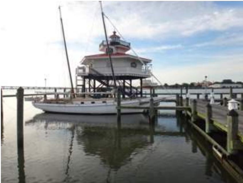
Illustration3: Bugeye CHESAPEAKE in Cambridge