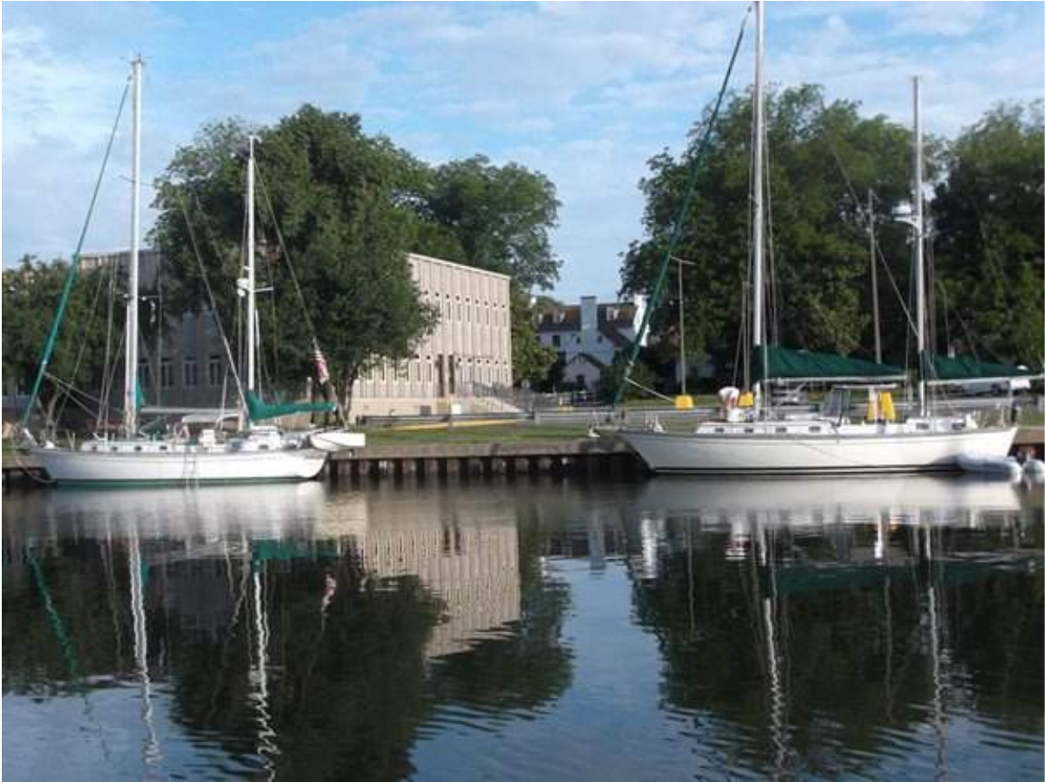
Illustration 2: SOUTHERN CROSS & TOOGOODOO in Cambridge