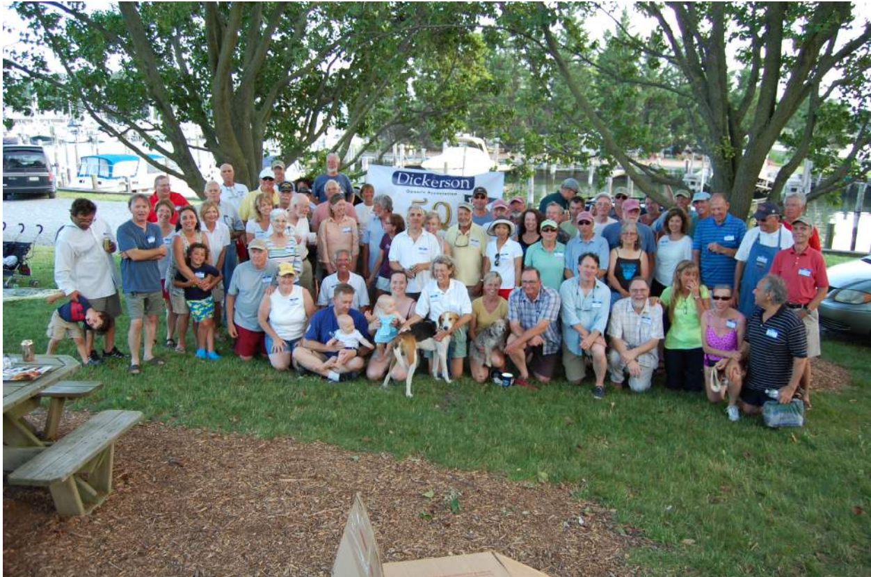
Thanks Brewer's Marina for the great hospitality