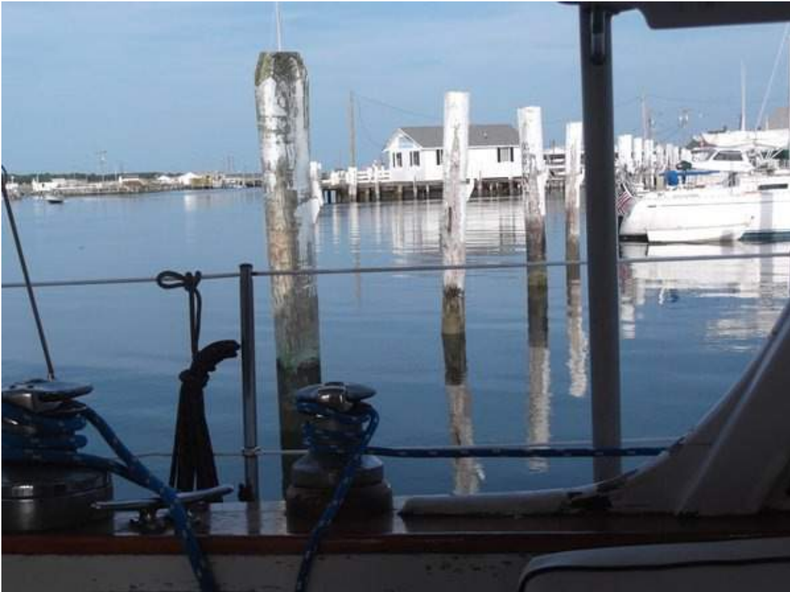
Illustration4: PLOVER at Parks Marina in Tangier