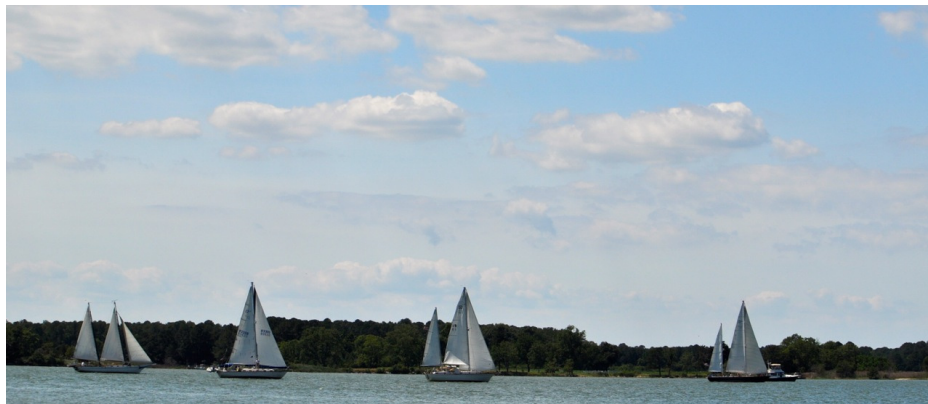
Parade of Dickersons

of sails ran from the Choptank River Light up the Tred Avon River to Mears Oxford Marina.