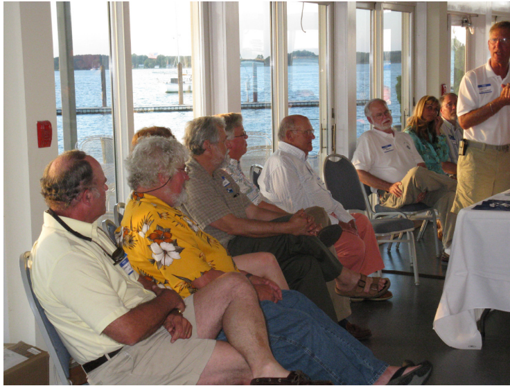
Panel of Boatbuilders

The panel discussion of the boatbuilders was quite lively and there were a number of stories about the good old days and some additional information on why the boats were built the way they were.