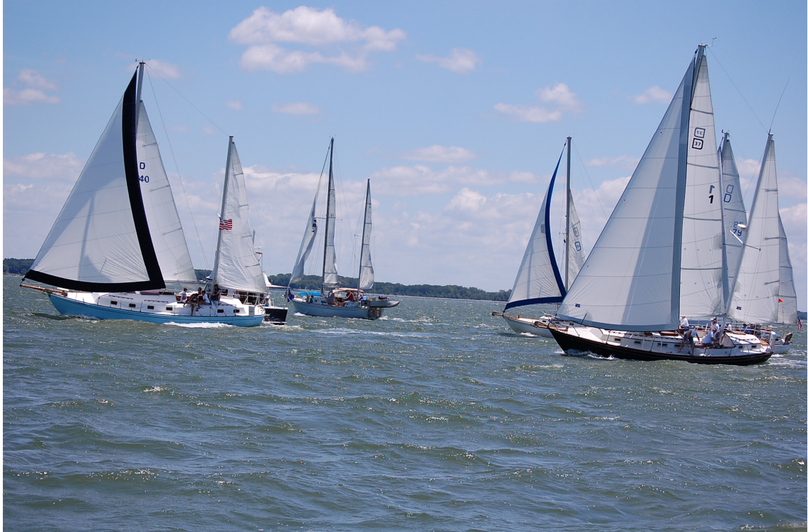
Start of the Race