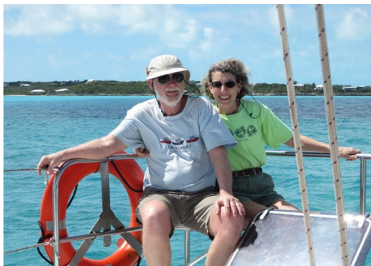
Life is good