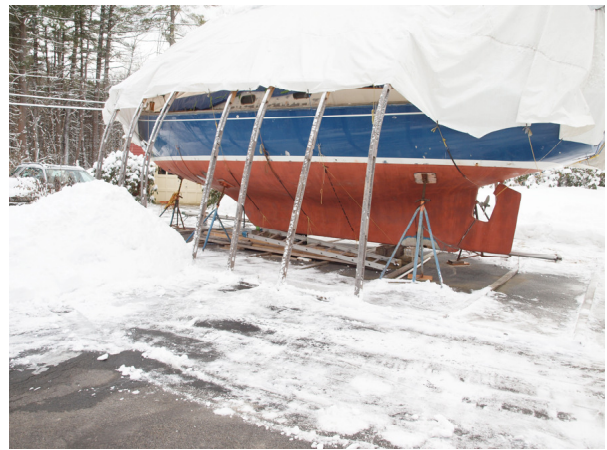
"Iris" under cover (in the driveway)